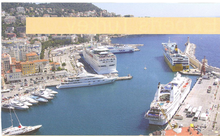
Nice – one of the five ports under French Riviera Ports' umbrella

Cruises, guarantee throughput of 450 calls a year and one million passengers by 2012, as well as providing a quality service for all ships using the facility.